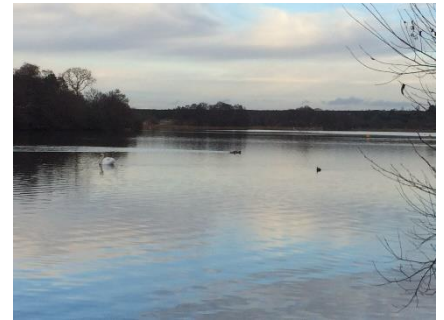
Frensham Great Pond